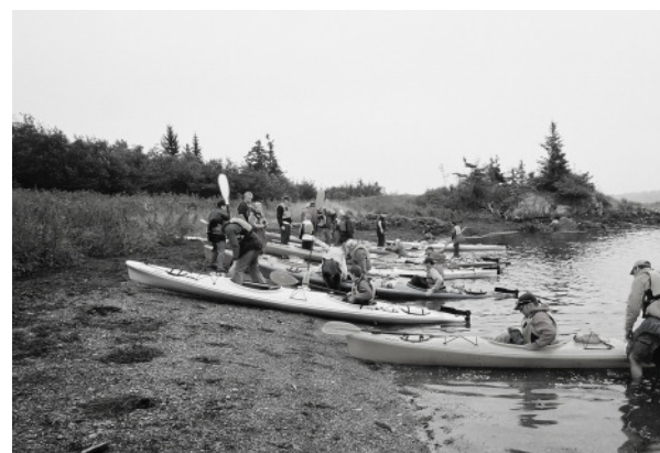
Participants on the Letang Islands Kayak Trip, August 2006.