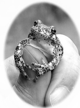
This gray treefrog did not attend the AGM (too dry).