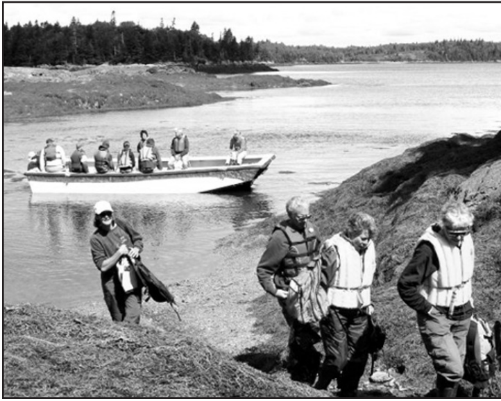
Charlotte Isles cleanup 2006