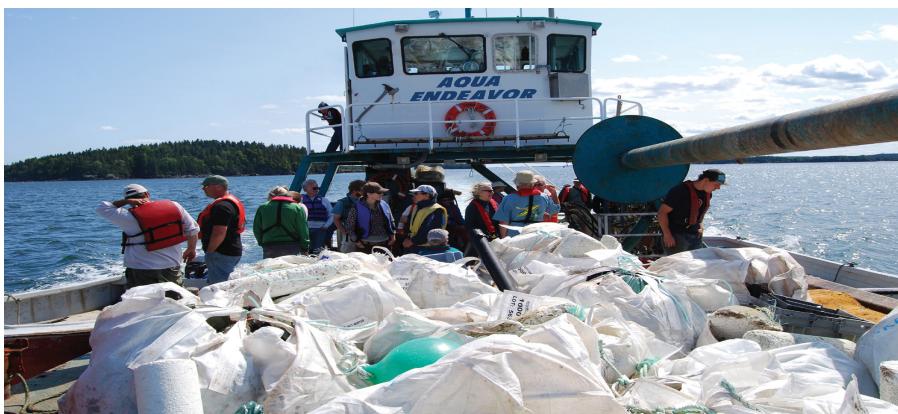
Volunteers head for dry land with garbage removed from three Passamaquoddy Bay islands. NTNB partnered with NCC to deliver the cleanup event this year.